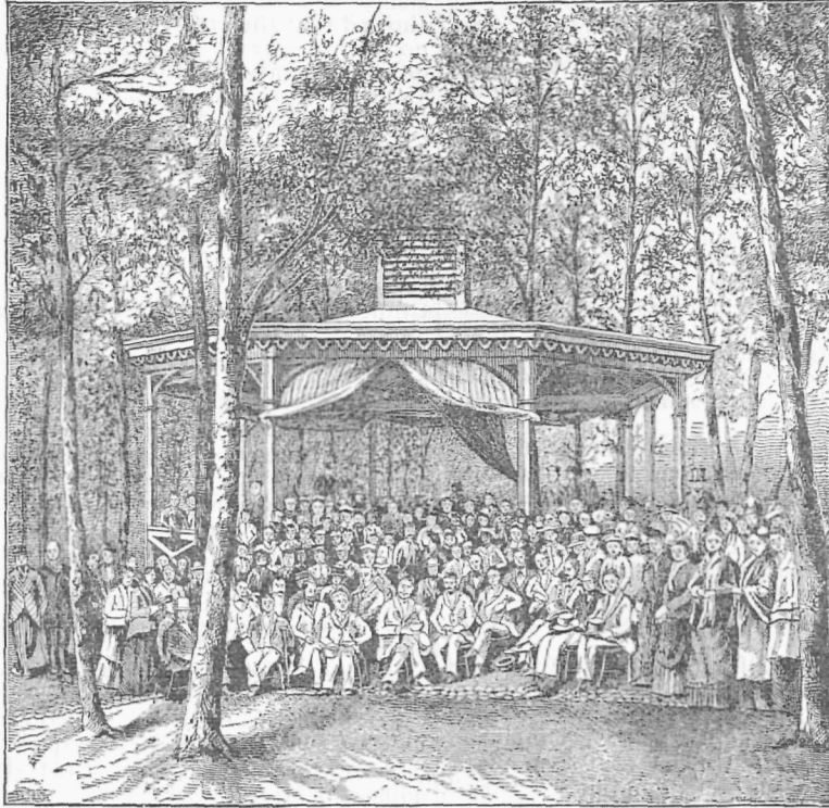
THE RECORD'S ILLUSTRATIONS.