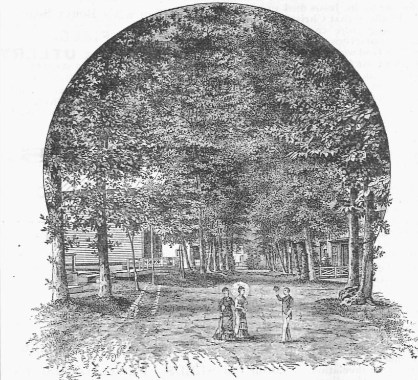
THE RECORD'S ILLUSTRATIONS.