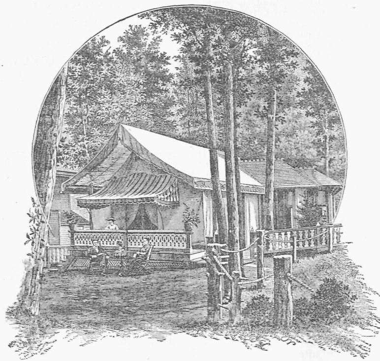
THE RECORD'S ILLUSTRATIONS.