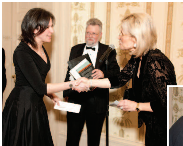
Kornitzer Award presentations