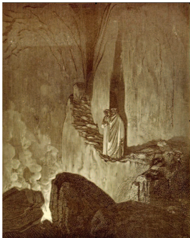
Dante’s “Inferno,” 1890 engraving by Gustav Doré

And then I had my own descent. On our last night together, as all twenty plus of us were gathered, after two glasses of wine, I fainted. Recovering from my daze, I found myself in the literal embrace of my companions who were either holding, touching, or addressing me with solicitous words and looks. The EMS was called and, with