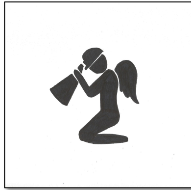
Graphic 5. SpiritLunker 5 - Praying 1