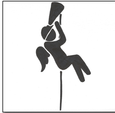
GRAPHIC 1. SPIRITLUNKER 1 - RAPPELLING 1

Descending into the context of ministry may very well be like rappelling into a cave. One stays alert to the expected and to the unexpected. Expecting darkness, the pull of gravity, dampness and coarse rock one keeps senses sharp for their peculiar configuration. The unique ledges, nubbin handholds and overhangs give the context its character and culture.