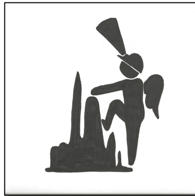
Graphic 4. SpiritLunker 4 - Climbing 1

Journaling the journey lays out the trail for others to follow. We survey the ground and measure the depths to write the route. The information recorded in the tables of this chapter is notes from the conversation during the Hangouts through Google+. Direct quotes have been recorded with quotation marks though no attempt was made by the author to record the person who framed the statement. Information contained in the tables without quotation marks is information having been recorded as a general summary of a thought though not a direct quote. Dates for the information contained in the tables correspond to the respective date of the Hangout. Here is what happened.