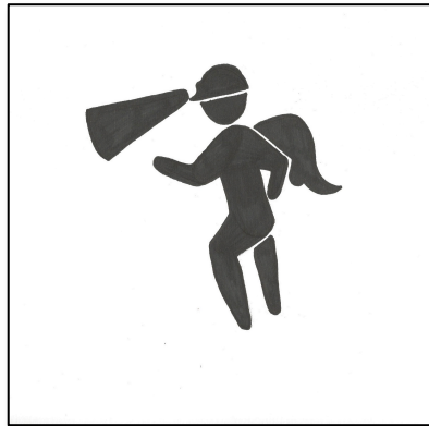
Graphic 6. SpiritLunker 6 - Surfacing 1