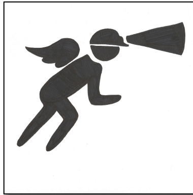
Graphic 2. Spiritlunker 2 - "Walking" 1

Walking into the tradition's cave senses the past through the echoes from the hard packed walls. One walks to the edge of light into full darkness and sits, voices seem to whisper from the partitions. These voices whisper full experiences of the living.