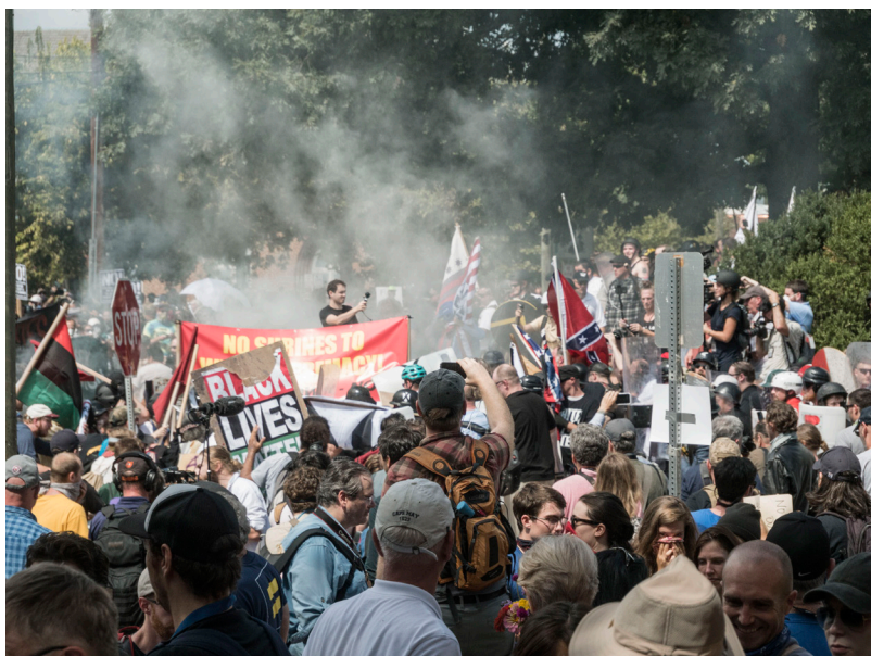
Untitled -taken at the Charlottesville Rally