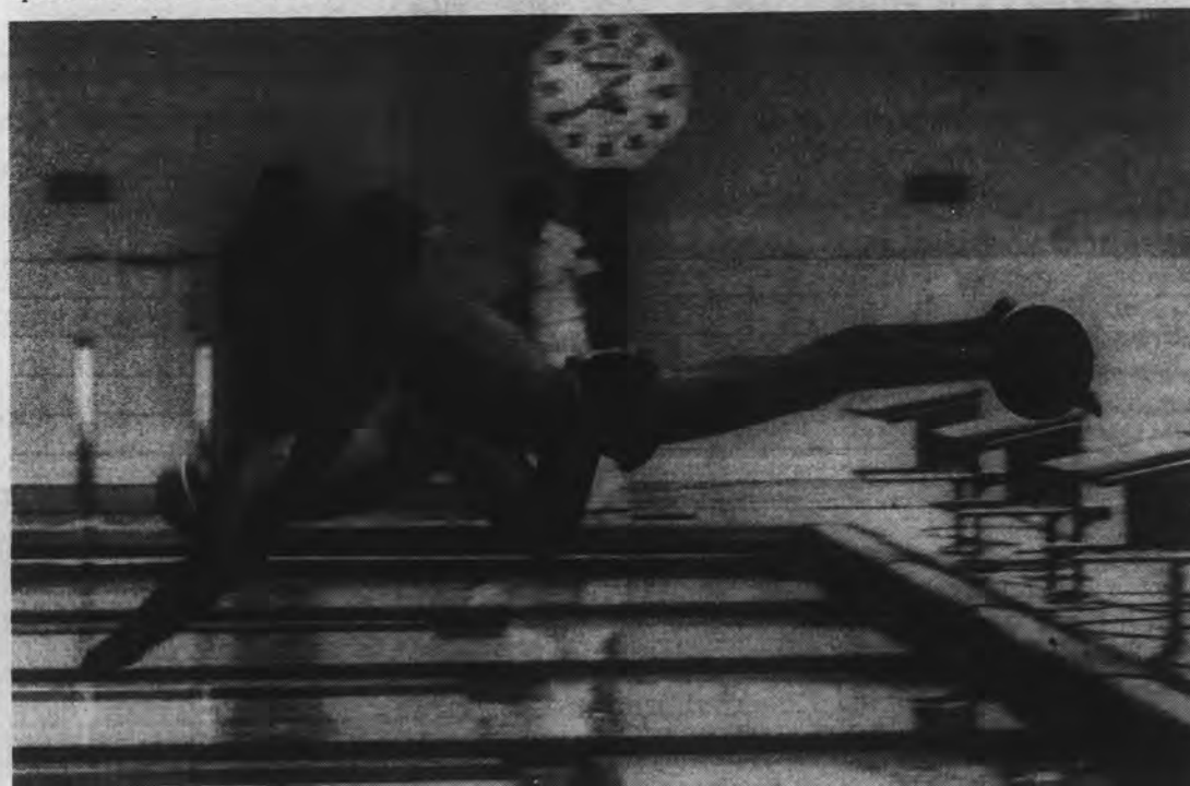
HUGH G. WRECTION

Some people were pissed that the coverage by the local media was not better, but hey, we can't keep everybody all safe and happy all of the time, can we?