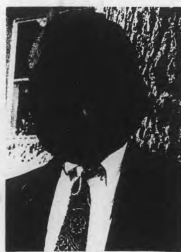
In three years