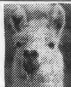
You Got Real Purty Hair...

In an unexpected press conference held early Wednesday morning, Governor Christine Todd Whitman announced that the 1996