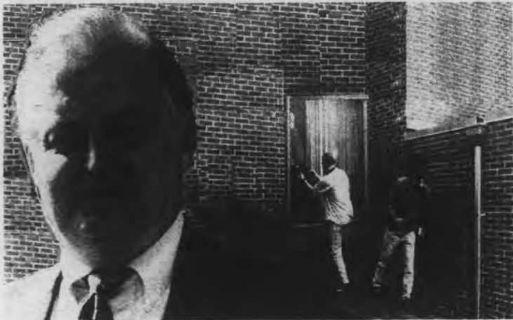
I AM THE WALRUS