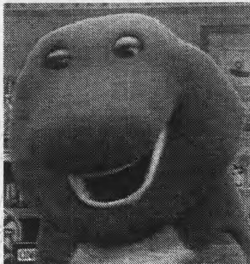
Barney will doubtless prove a hit with the college crowd.