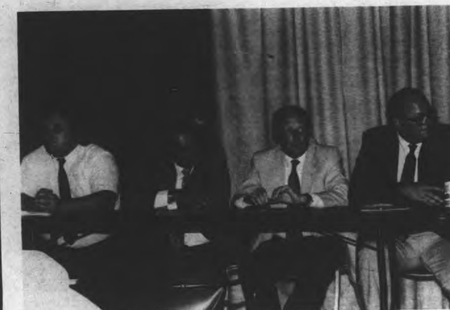
Sleepy, Grumpy, Bashful and Doc

Gal, 20, undeclared major, really into cosmic consciousness, devout believer in crystal power, big Shirley MacLaine fan, dynamic life philosophy. Call me anything you like at 7055.