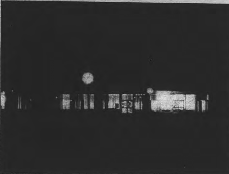
The U.F.O., exclusively photographed by the Acron's private helicopter under extreme duress. We hope you appreciate the pilot's bravery and self-sacrifice.

dent Thomas Kean, the craft sits on the site of the new university center, which is still in the planning stages. The center cannot be built until the craft either moves itself or is towed away by security.