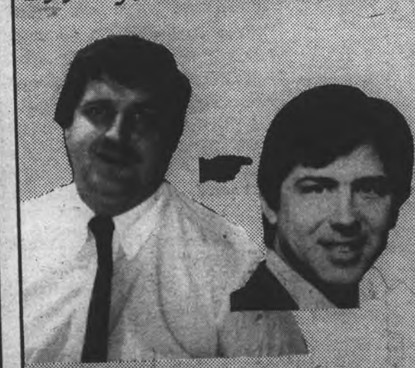
He's the Assistant, I'm the Coach