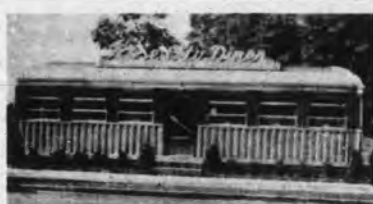
Sodas Sundae Milkshakes

The second question discussed at length was brought up by a student who claimed he had been tested at least once on every class day since October 1, with but one exception. Those members of the faculty who had anything to say on this subject condemned Drew's testing methods.